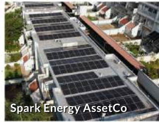
Spark Energy AssetCo