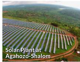
Solar Plant at Agahozo-Shalom